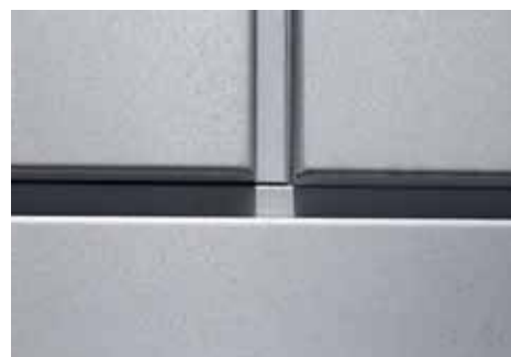
VMZ Mozaik® in AZENGAR®