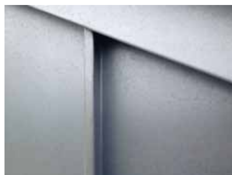
VMZ Standing seam in AZENGAR®